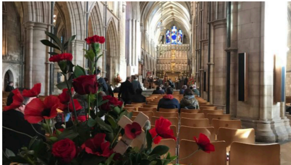
Armistice Commemoration at Southwark Cathedral.