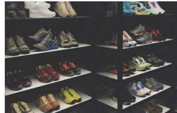
Original 80's Adidas shanes that have stood the test of time.

Adidas have opened the doors to 'ZX - The roots of running' an exhibition at 21-23 Earlham St, Seven Dials. Curated by Adidas' own Gary Aspden, the exhibition is a testament to the influence and diversity of Adidas classic 80's training shoe family; ZX.