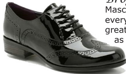
Clarks Brogues £54.99