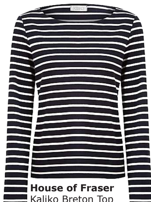
House of Fraser Kaliko Breton Top £49.00

Freshen up your comfy jeans or pair with go-to denim shorts. A sleek of red lipply will add elegance to your outfit.