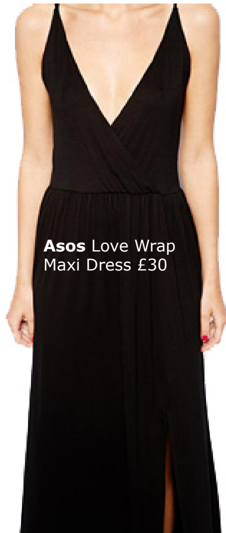
Asos Love Wrap Maxi Dress £30

A blazer can add sophistication to your outfit or it can be a piece you throw over a day dress.