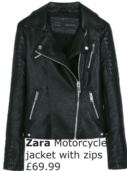
Zara Motorcycle jacket with zips £69.99

This piece is worth investing in as it's one of the few pieces that gets better with age. The leather bike is the grab-and-go fashion staple that can take you from festival to dinner date.